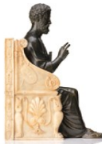
Chair of St Peter

Donations for new Boiler Fund to date £6,148.